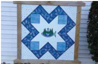
LAKEVIEW CHURCH OF THE BRETHREN

How can a quilt block have similarities to a church? Perhaps this way. One quilt block alone can be beautiful. Let it be joined by other 'blocks' and it becomes a fine quilt top. Add 'filler' and 'backing' and you have an inviting, warm comforter!