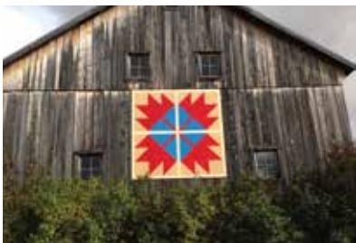
MAPLE LEAF AT MARILLA MUSEUM

The Maple Leaf pattern has been chosen because of Marilla's long tradition of producing maple syrup and the area's abundance of maple trees. The pioneering Chesboro family of Marilla Township held a family tradition of planting a maple tree for each new birth in the family. In the early years of Marilla Township, according to the 1883 agricultural census, maple syrup was described as maple molasses. The Marilla Historical Society maintains four historic buildings (on site).