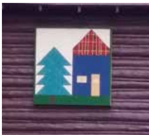
BRETHREN HERITAGE ASSOCIATION

The Brethren Heritage Association Quilt Square is a Log Cabin design, chosen because the museum itself features much of the logging industry at the turn of the 20th Century when Brethren was established and many of the settlers built log cabins too. The main museum itself is a log cabin.