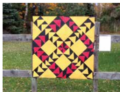
NORWALK RAILROAD CROSSING QUILT

Folks were living in Norwalk when the State Road, now called Old U.S. 31, was built through it in the 1850s. The second post office in